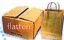
Corrugated cardboard & paper bags