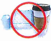
Styrofoam® or paper to-go boxes or cups