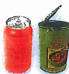
Cans (do not crush or flatten)

NEW: Recycle plastic screw-top caps on EMPTY plastic containers!