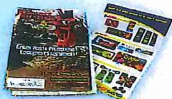
Magazines, brochures & catalogs