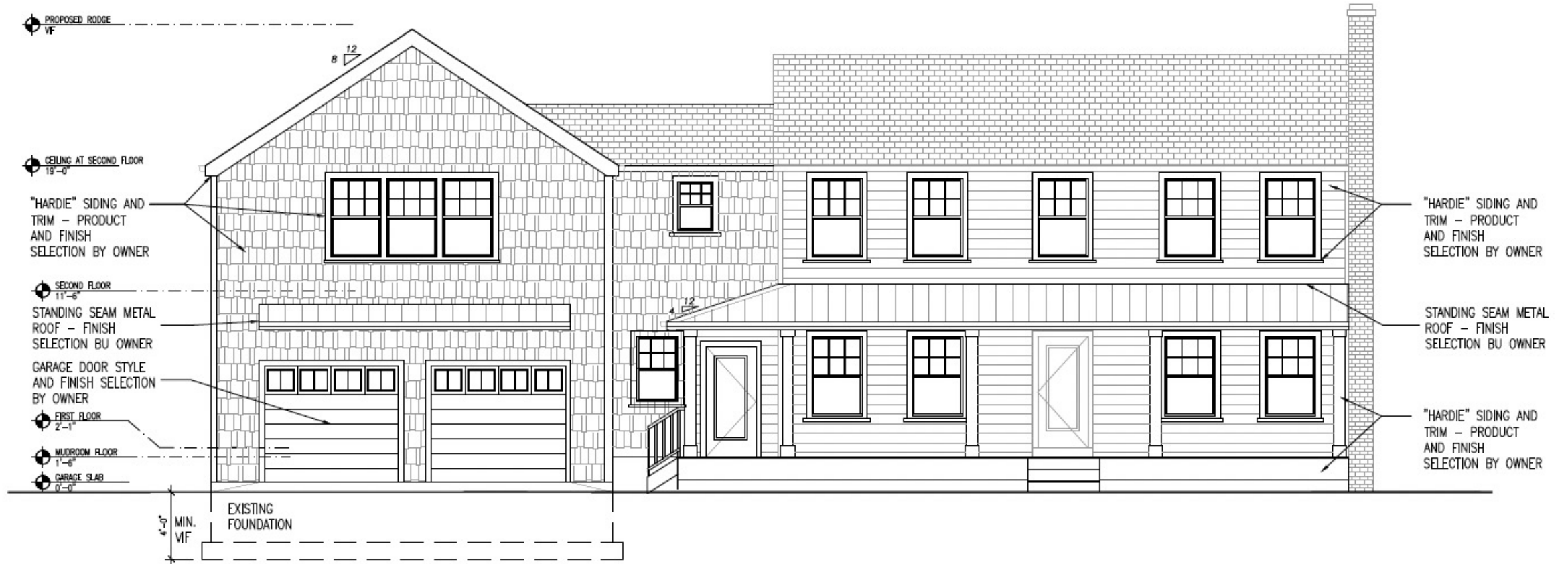
1 WEST ELEVATION SCALE: 3/16" = 1'-0"