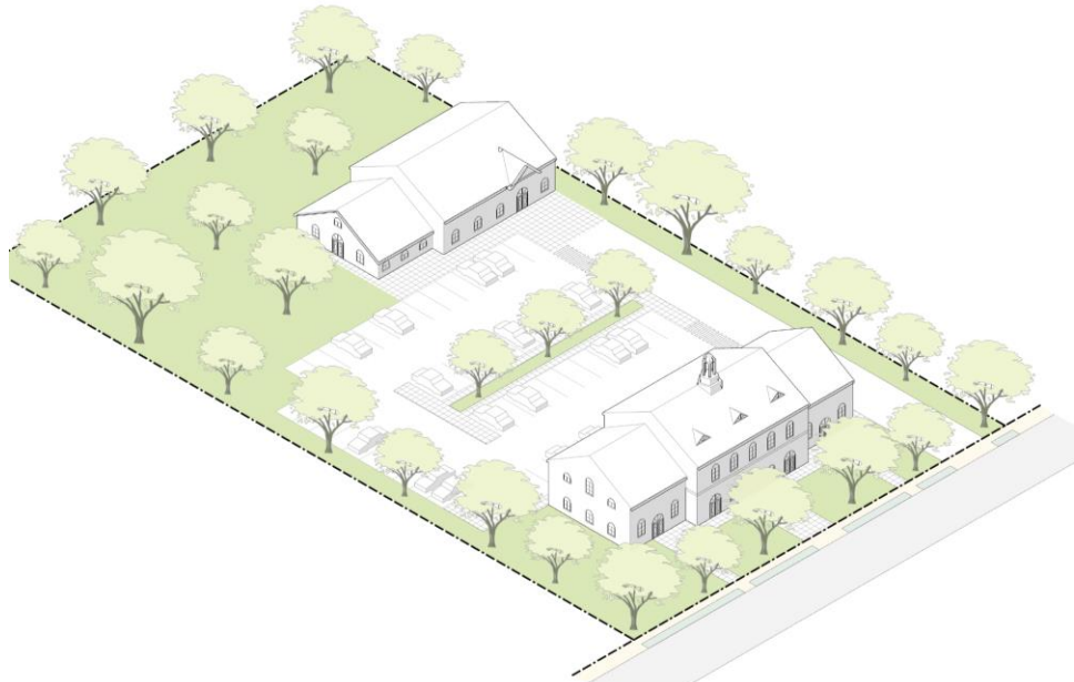
Figure 10. Bay Road Civic Sub-District Vision Illustration