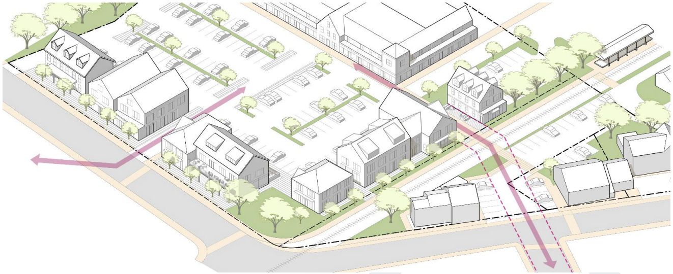
Figure 8. Depot Square Sub-District Vision Illustration